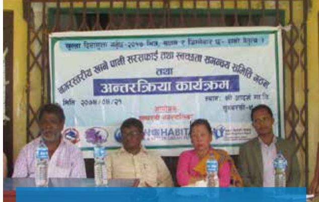
M-WASH-CC formation in Sunbarshi Municipality