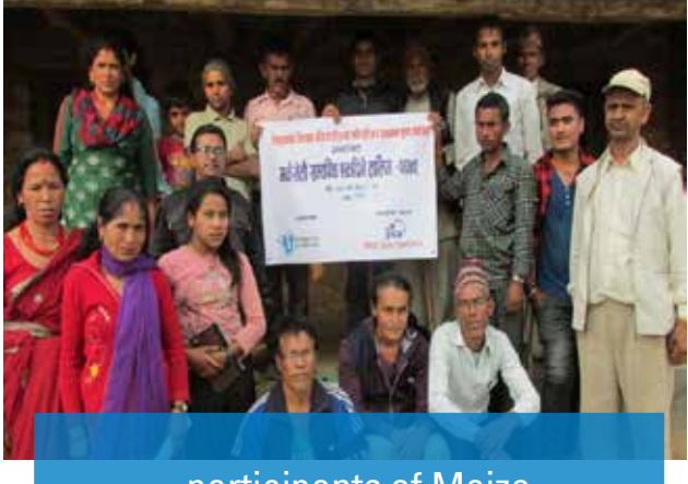
participants of Maize farming training