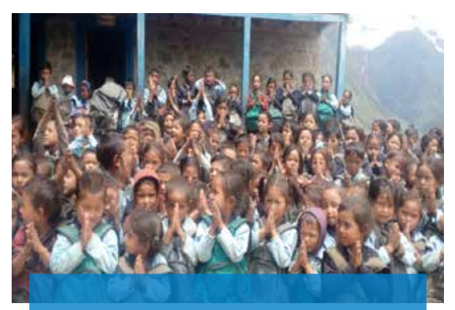
Taking picture after receiving educational materials