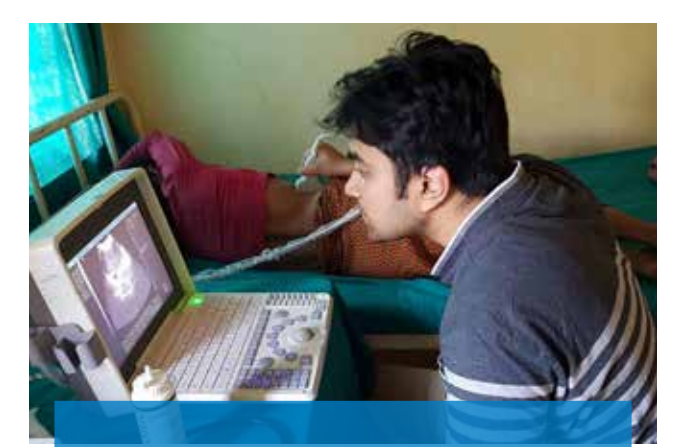
Doctor performing Ultra Sound Check up