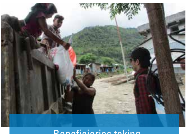
Beneficiaries taking Agricultural material