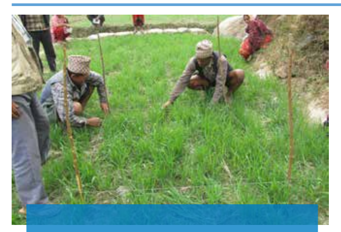
Wheat Farm Practical Training